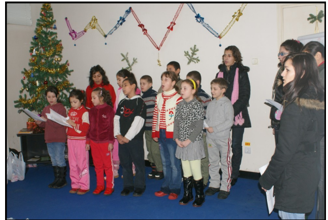
Children singing carols for the former political prisoners in Iasi