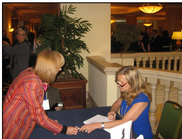
Meeting Mrs. Kerry Kennedy

The centre followed two different directions for the campaign: public informing and getting in touch with the companies.