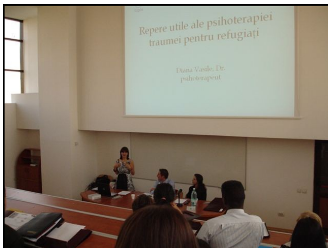
ICAR staff participating in JRS seminar

vulnerable persons among foreigners on Romanian territory. Traumatic experiences from the country of origin", organized by the Jesuit Refugee Service - Romania in collaboration with the Faculty of Psychology within „Spiru Haret” University. The main issues discussed were: categories of persons facing the risk of trauma, causes and reactions to traumas in the country of origin, useful landmarks in trauma psycho-therapy for refugees, international standards in the field of assistance for vulnerable persons, legal assistance for victims of torture, traumatic effects of torture on vulnerable persons.