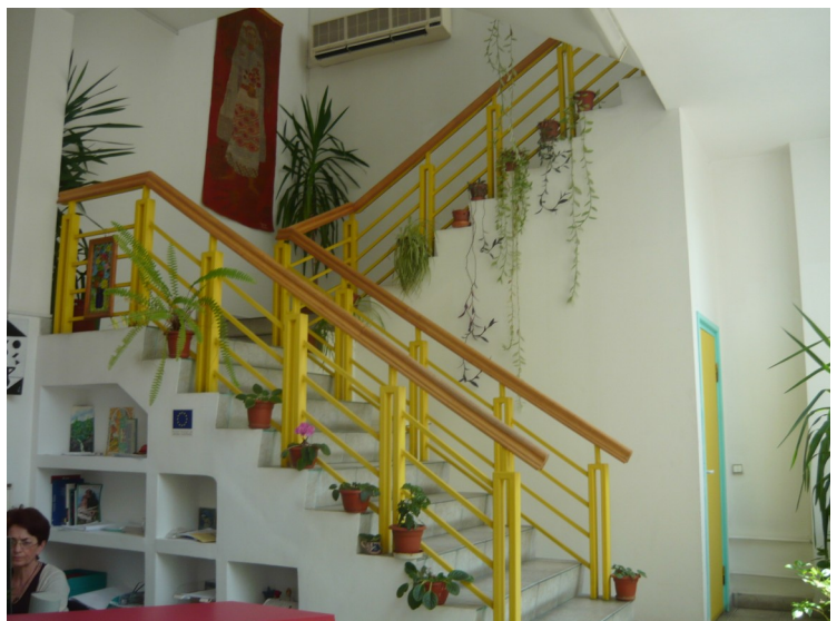
ICAR Bucharest reception area

ICAR's specialist in the refugee centre also offered social counselling on issues like emergency services in Romania, Romanian educational system, continuation of studies, opportunities of spending free time; medical counselling (information on personal hygiene, healthy eating and diets, facilitation of medical consultations, accompaniment to the hospital etc.); cultural orientation sessions (Romanian customs and traditions, Romanian cuisine, climate in Romania etc.); visits in the city to different cultural or religious sites. The volunteers coordinated by ICAR's psychosocial counsellor conducted 50 Romanian language classes in which over 100 refugees and asylum seekers participated.