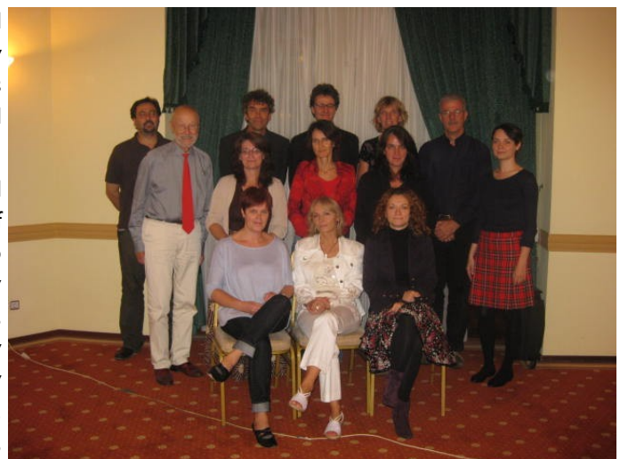
Participants in the seminar "Good practice in torture care", Bucharest, October 2009

The event enjoyed very good media coverage and as an overall effect encouraged our colleagues to continue their difficult work.