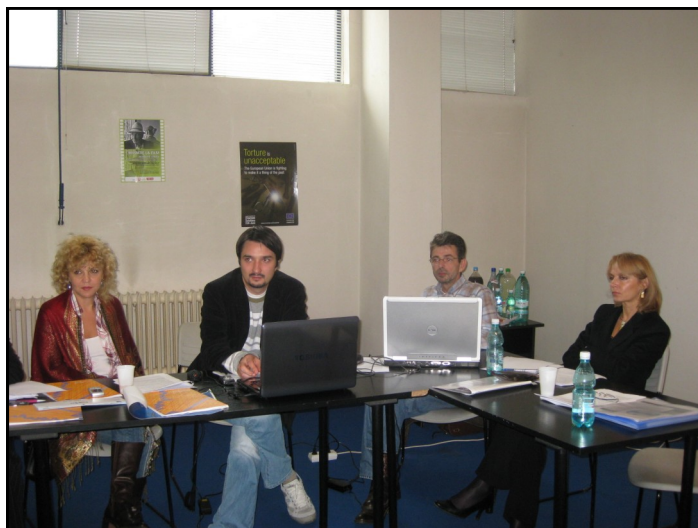
ICAR centers' management team