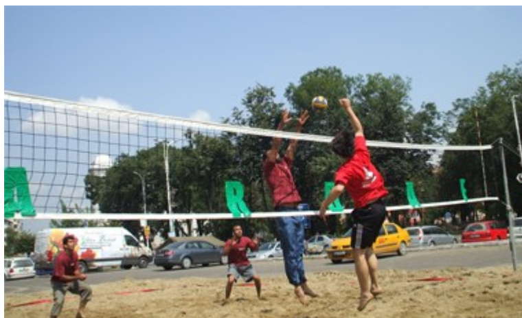
Asylum seekers at a volleyball championship, Radauti