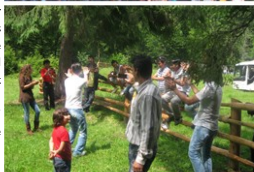
Refugee Day festivities in Timisoara (up) and Radauti (down)