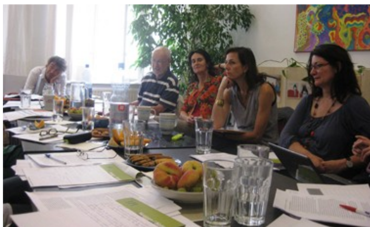
ERF Community Actions project meeting, Graz, Austria