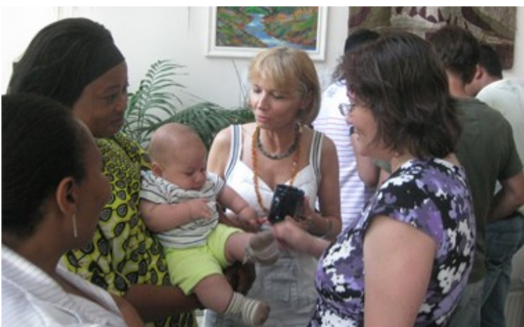
Children's Day in Bucharest

In Bucharest and Radauti reception and accommodation centres (places where there are more asylum seeker children) ICAR organized special parties for kids with picnics, gifts, games and sport competitions. The International Children's Day on 1st of June was chosen at the World Conference for the Well-being of Children in Geneva, Switzerland in 1925.