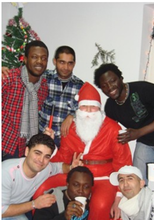
Christmas festivities for asylum seekers in Galați

The main activities consist of social counselling, organizing educational and cultural activities (Romanian language classes, cultural orientation sessions, intercultural exchanges), organizing recreational and festive activities for asylum seekers, as well as specific psychological and social assistance for vulnerable groups of asylum seekers (unaccompanied minors, single parent families, elderly, persons with chronic illnesses, victims of torture or other forms of severe physical and psychological violence). Identification and evaluation of vulnerable people through screening and needs assessment is an activity of main concern due to the specialized assistance this group needs to receive. Integrated rehabilitation services are offered at outreach offices or at ICAR premises.