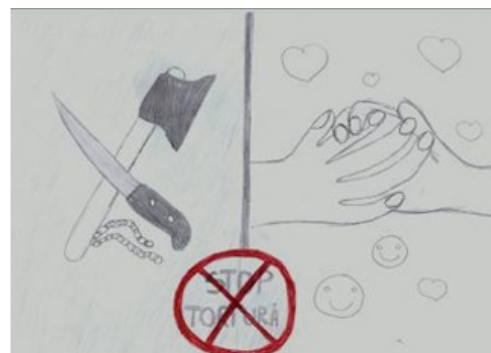
Children's drawings on the subject “A world without torture”