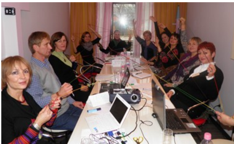
Burnout session, Chisinau, Republic of Moldova