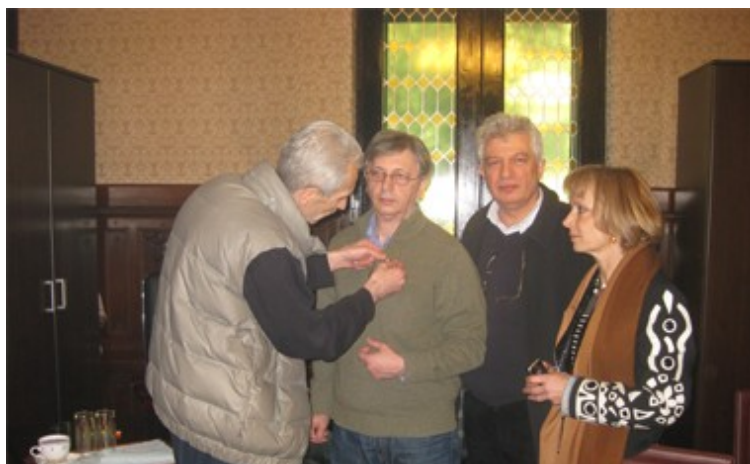
Celebration at Association "21 December 1989"

A team of 7 lawyers are currently implementing ICAR's litigation project with the view of testing the Romanian judicial system capacity to implement national and international legislation concerning reparation. When necessary, after exhausting the domestic remedy cases