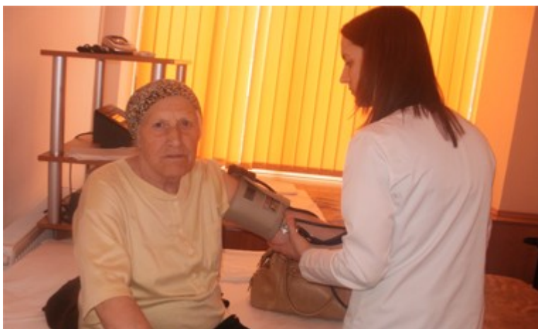
Medical consult at ICAR Craiova

During 2010 the ICAR centres assisted on a regular basis over 650 patients, victims of serious human rights violations either in Romania during communist period or in their country of origin from where they ended in Romania as asylum seekers and refugees.